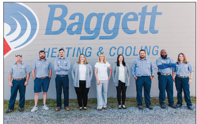
Winner of the Western Region's 2020 QCN Excellence Award is Baggett Heating & Cooling.