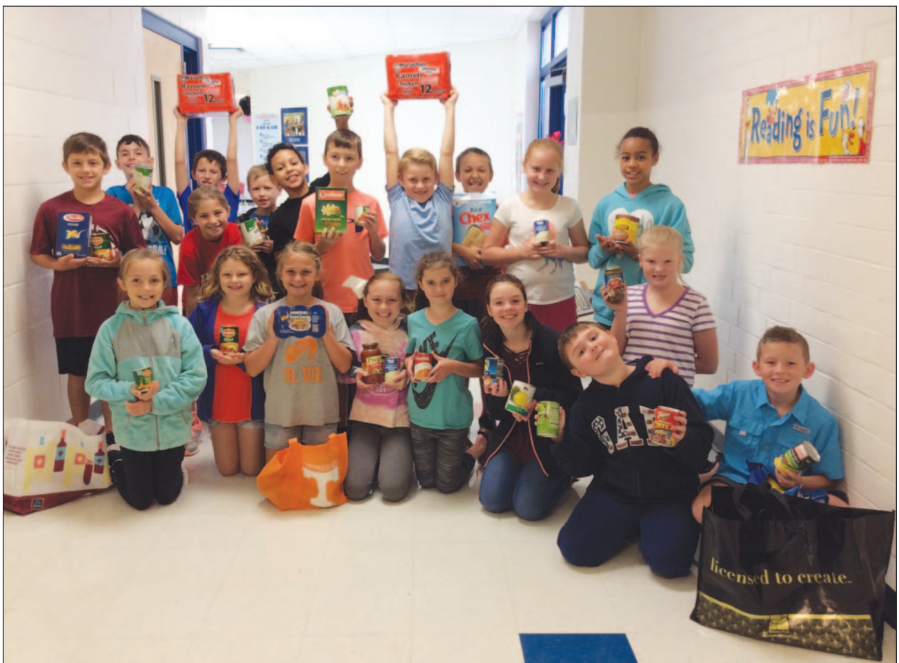
West Cheatham Elementary School students show off food they collected during last year's food drive.

Individual schools will coordinate the details for their respective food drives, so please be sure to check with your child's school for specific collection dates and additional information.