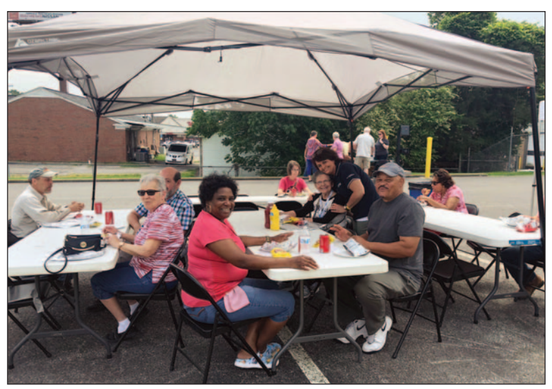
Members enjoy food and fellowship at last year's Member Appreciation picnic in Clarksville.