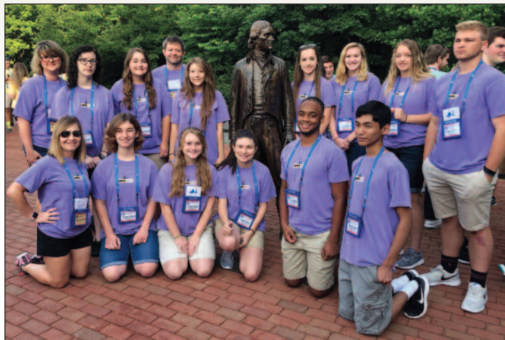
Youth Tour delegates visit Monticello, home of Thomas Jefferson, our nation's third president and author of the Declaration of Independence. Below, students take a break from exploring the Smithsonian's Museum of Natural History to pose for a photo.

The annual event, sponsored by CEMC and the Tennessee Electric Cooperative Association, provides young