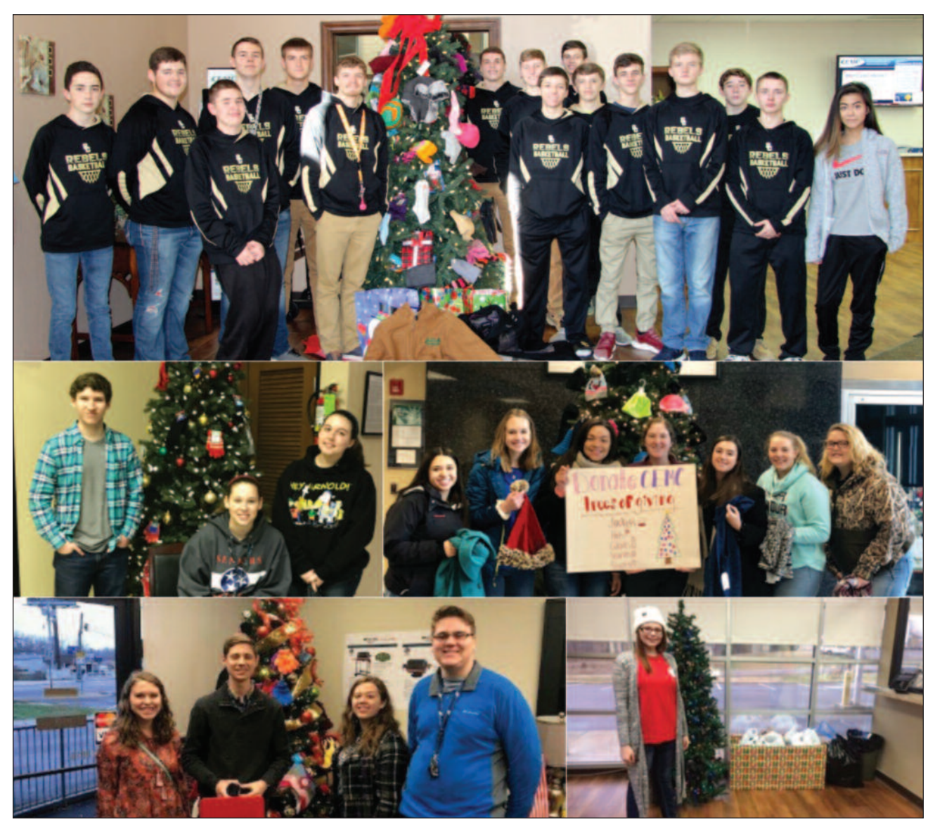
Clockwise from top: The Stewart County High School men's basketball team decorated Dover's tree, Cheatham County Central High School's art club decorated Ashland City's tree, Montgomery Central High School's National Honor Society decorated Clarksville's tree, Portland High School's Academic Team decorated Portland's tree and Greenbrier High School's Future Teachers of America decorated Springfield's tree. Not pictured is White House High School's National Honor Society, which decorated White House's tree.

The Trees of Giving community project is made possible each year by high school students participating in various clubs and organizations as well as CEMC employees and members across the entire five-county service area.